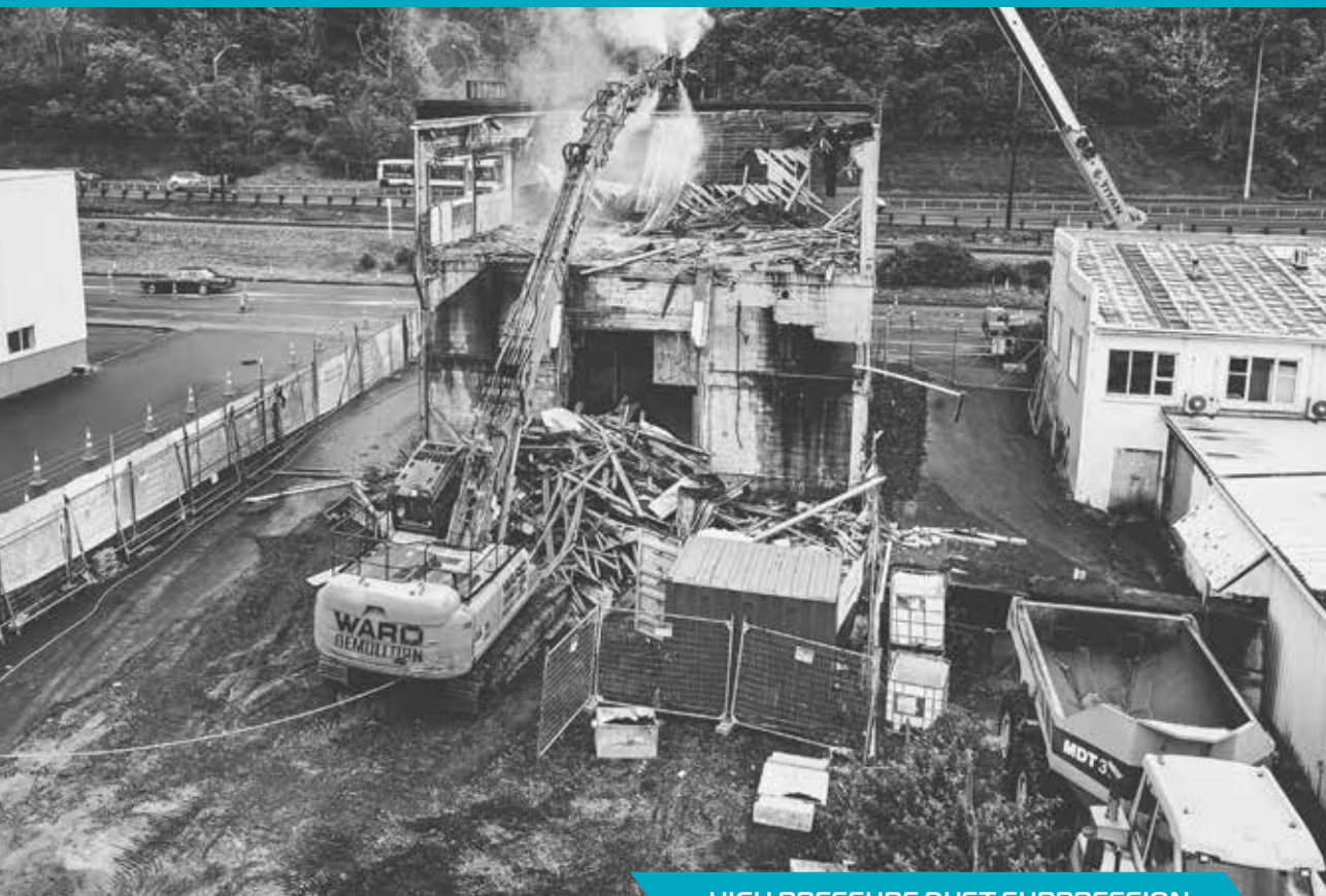
HIGH PRESSURE DUST SUPPRESSION